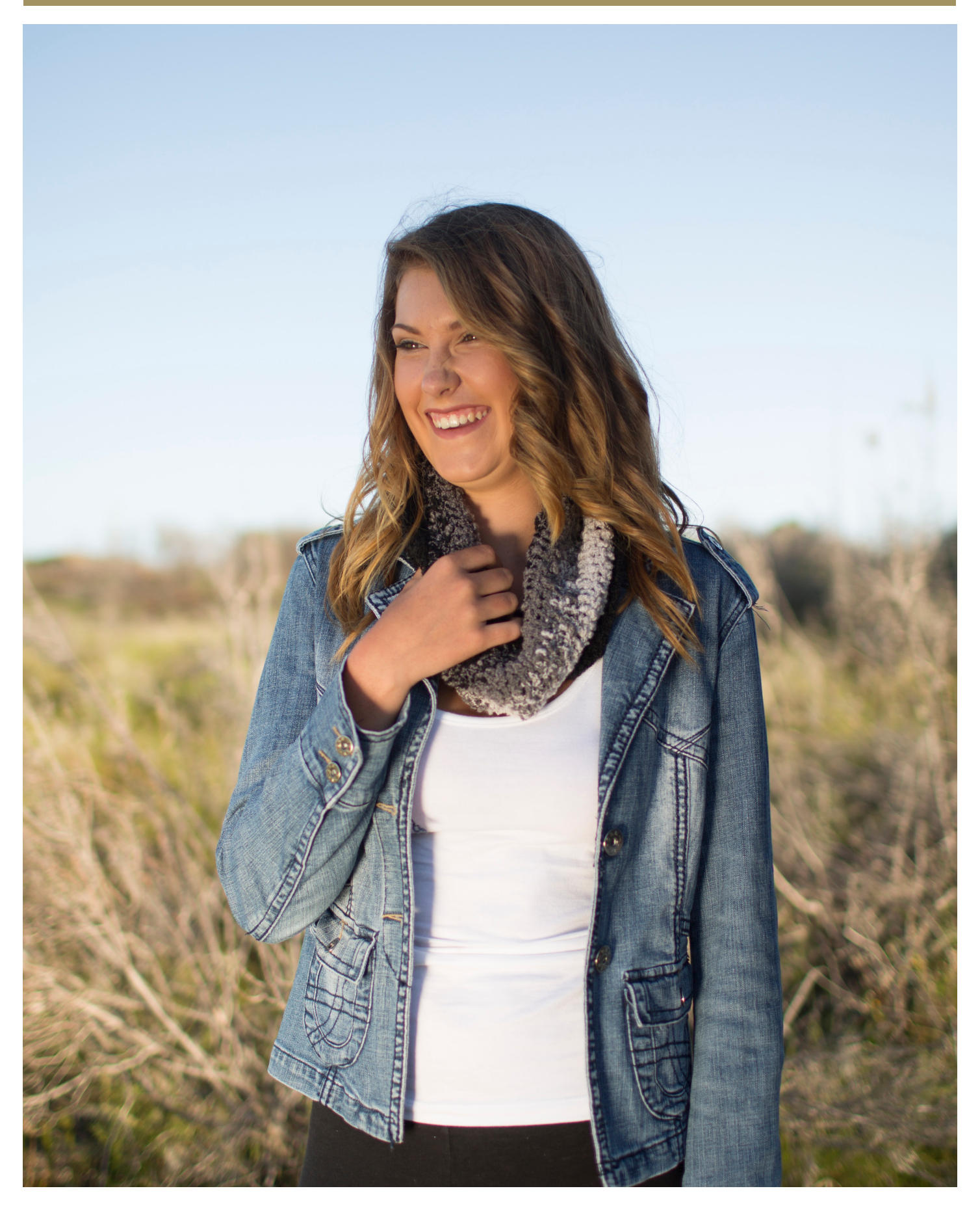
- WWW.AFRICANEXPRESSIONS.CO.ZA -