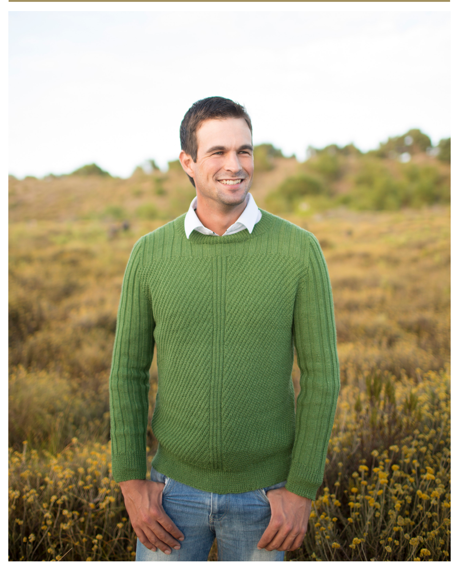
- WWW.AFRICANEXPRESSIONS.CO.ZA -